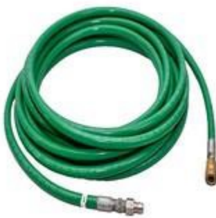
High Pressure Hose