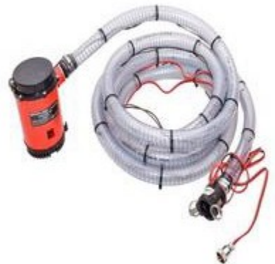
Water Inlet Pump-Hose