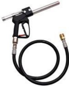
Zero Thrust (Z/T) Gun