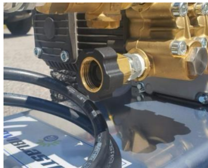
Water Inlet - Figure #1