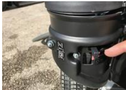
Fully engage Choke - Figure #13