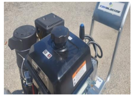
Fuel Level - Figure #4

4. Fill lubricating oil(s) to proper level(s) in the pressure pump (Red cap on pump) (Figure-5) and engine (Yellow cap on head cover) (Figure-6) per manufacturers' operating manuals.