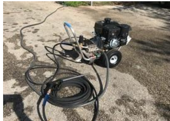
Overall system set up - Figure #17