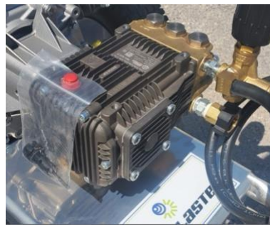
Pump Oil Level - Figure #3