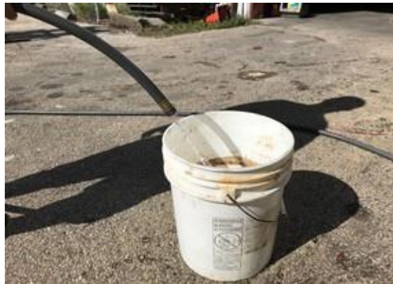
Fill up a 5 gallon bucket in less than one minute - Figure #10

To make sure the source is providing 5 gallons per minute try filling up a 5 gallon bucket in less than a minute. Figure 10.