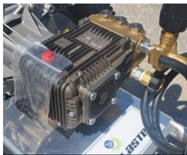
Pump Oil Red Cap - Figure #5

4. Fill lubricating oil(s) to proper level(s) in the pressure pump (Red cap on pump) (Figure-5) and engine (Yellow cap on head cover) (Figure-6) per manufacturers' operating manuals.