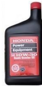
Engine Oil - Figure #8

5. To provide water to the CaviBlaster® 0520-G power unit, connect garden hose to the water inlet connection on the power unit (Figure-9).