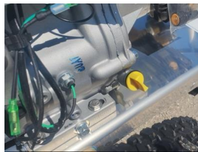
Yellow Cap on head cover - Figure #6

NOTE: Pressure Pump Oil (SAE 30W-Non-Detergent) Figure-7; Engine Oil (SAE 10W 30) Figure-8