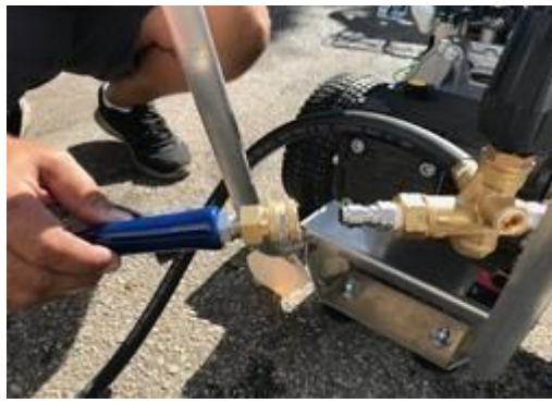
Connect HP Hose to the quick connect under pressure regulator - Figure #11