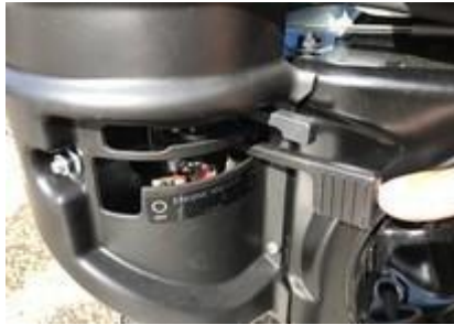
Throttle at the On position - Figure #12