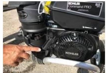
Recoil Assembly - Figure #14