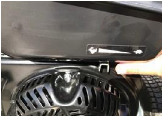
Throttle to Max position - Figure #16

9. Once the unit is running and warm, move the throttle to Max. (figure 16) The system is now ready to operate. (figure 17)