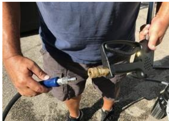
Connecting the gun to the High Pressure Hose - Figure #15