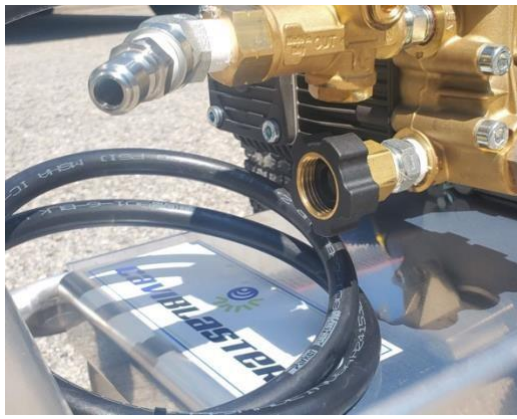
Connect Garden Hose to Water Inlet - Figure #9

When feeding the CaviBlaster® with a water source, the source must supply water at a volume of greater than 5 gallons per minute at a maximum pressure of 70-psi. Connect the water source to the inlet of the pressure pump (Figure-9). Ensure that the garden hose is connected to the pressure pump and the water is on prior to starting the pressure pump.