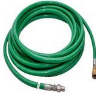
High Pressure Hose