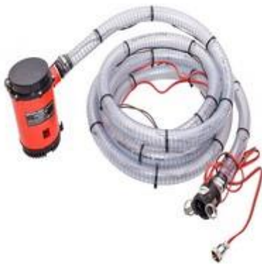
Water Inlet Pump-Hose