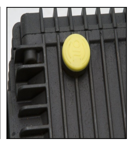
Figure 1 Figure 2 Figure 3