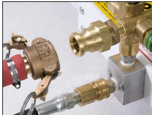
Figure 4 Figure 5